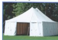
County (C) Marquee: 6M x 6M 20ft x 20ft

All booking subject to availability of marquees and volunteer teams for delivery, pitching and striking. By using these marquees you will be supporting local Rainbow, Brownie, Guide and Senior Section Girlguiding units.